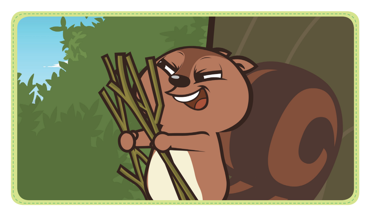
"I'm building something," said Kip. "I need a lot of sticks for it."