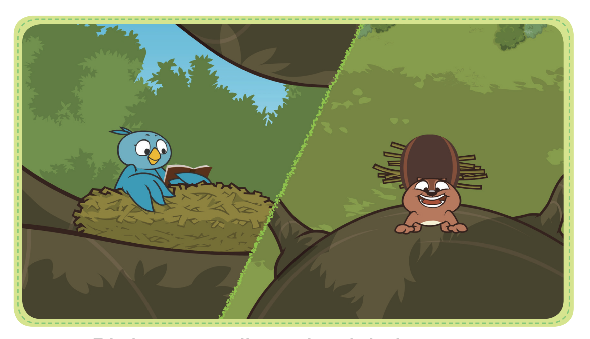
Bird was reading a book in her nest. Kip came up the tree. He was carrying a bunch of sticks.