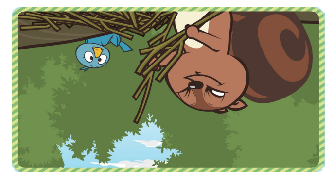
Copyright © 2013 by Little Fox Co., Ltd. All rights reserved.