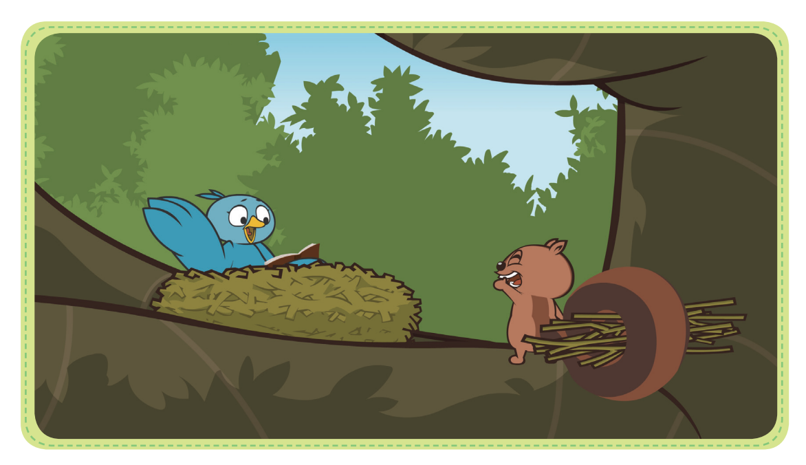
"Good morning, Bird," said Kip. "Good morning, Kip," said Bird.