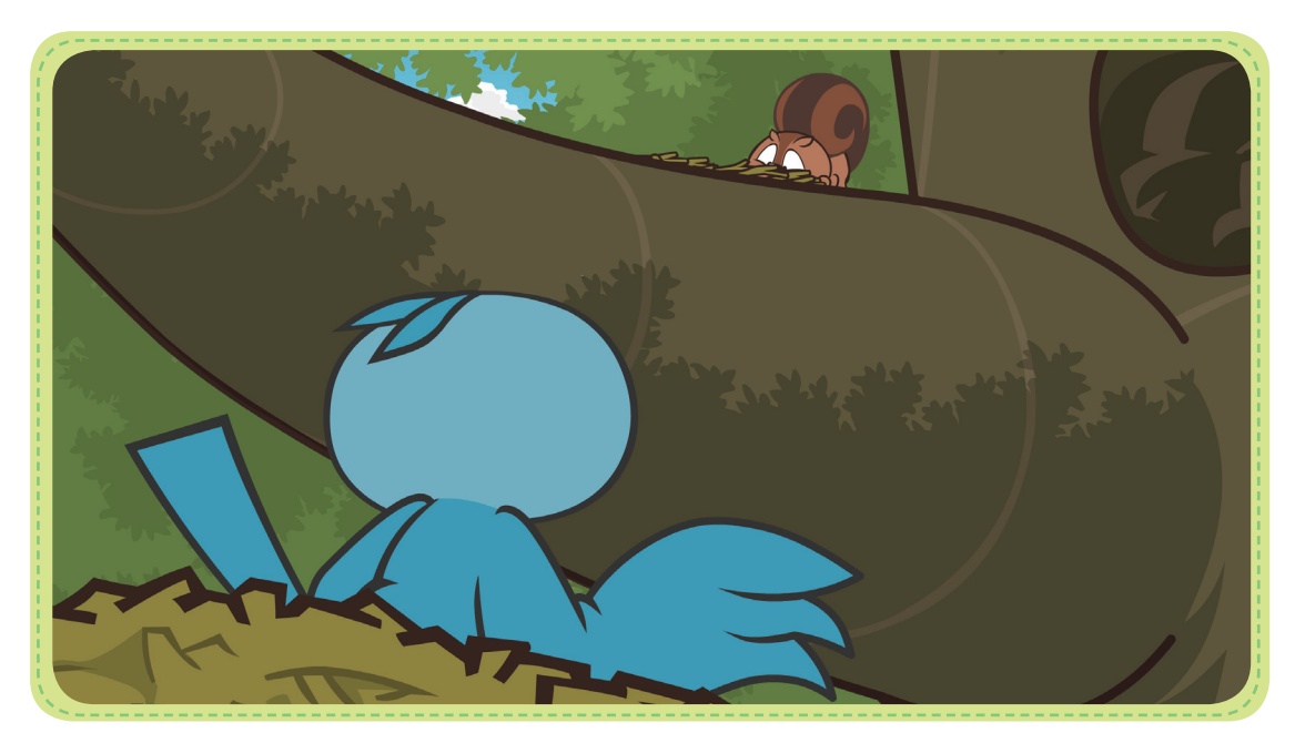
"Hmm," said Bird. "I wonder what Kip is doing."