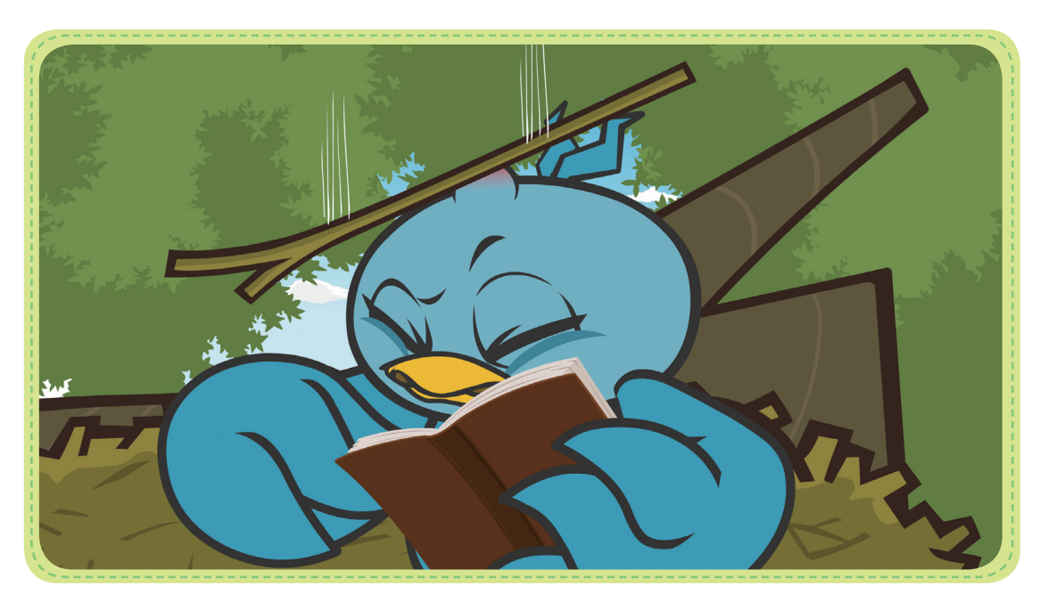
Bird went back to reading her book. Crash !