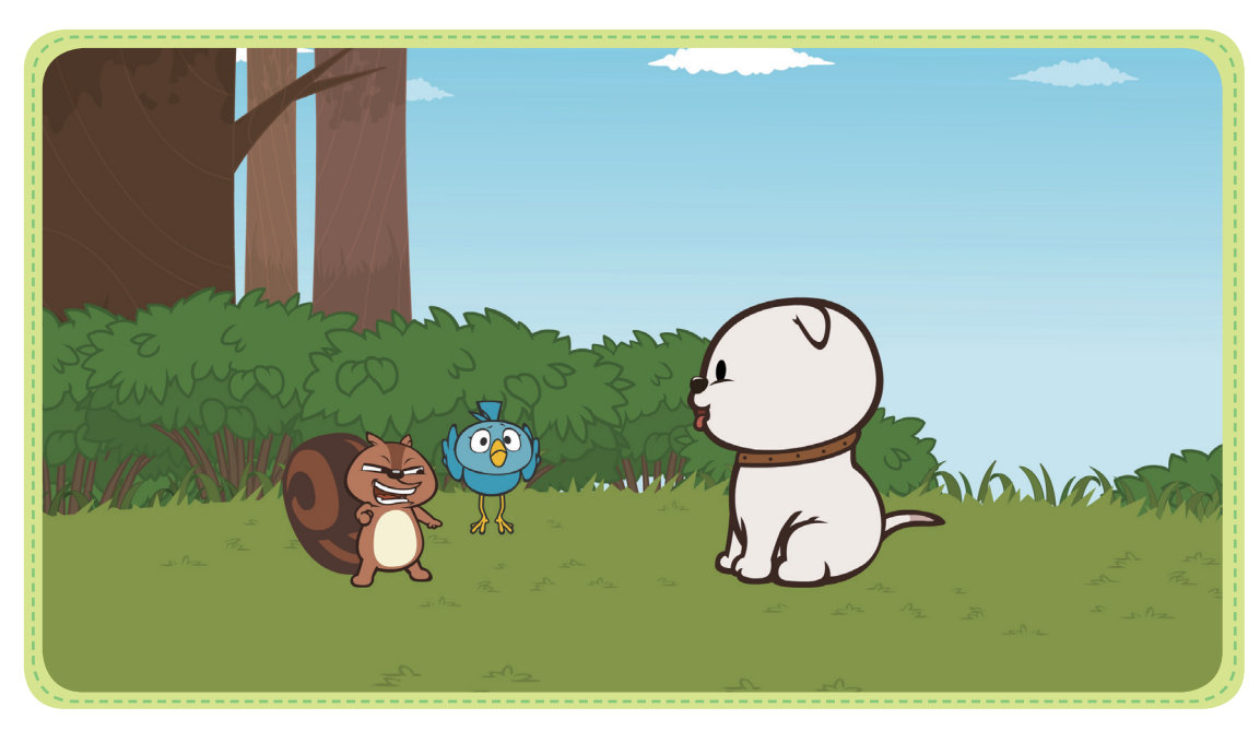
"Sit down," said Kip. The puppy sat down!