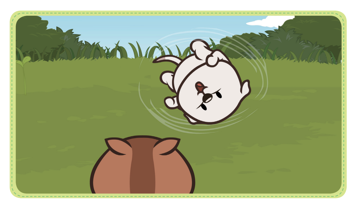
"Roll over," said Kip. The puppy rolled over!