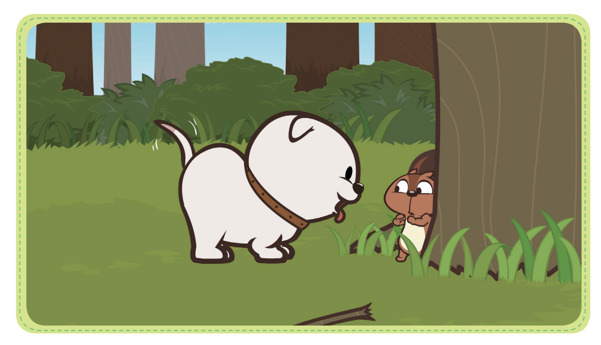
"Yip! Yip!" It barked. The puppy just wanted to play! Kip had an idea . . .