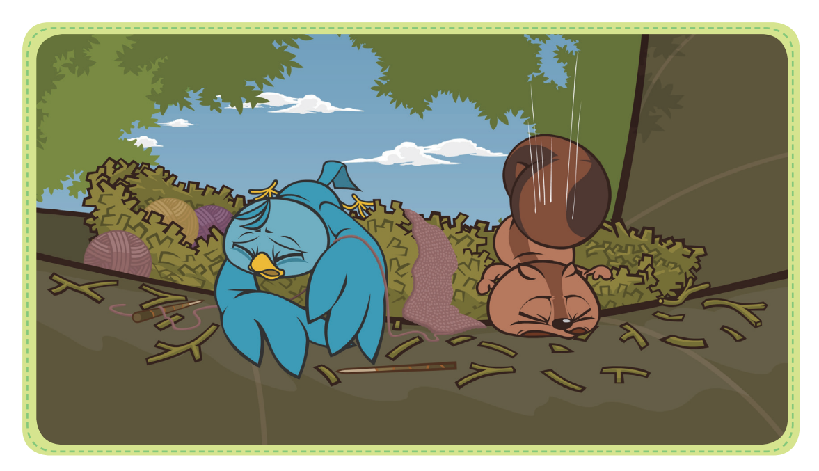
Crash! Kip smashed right into Bird's nest!