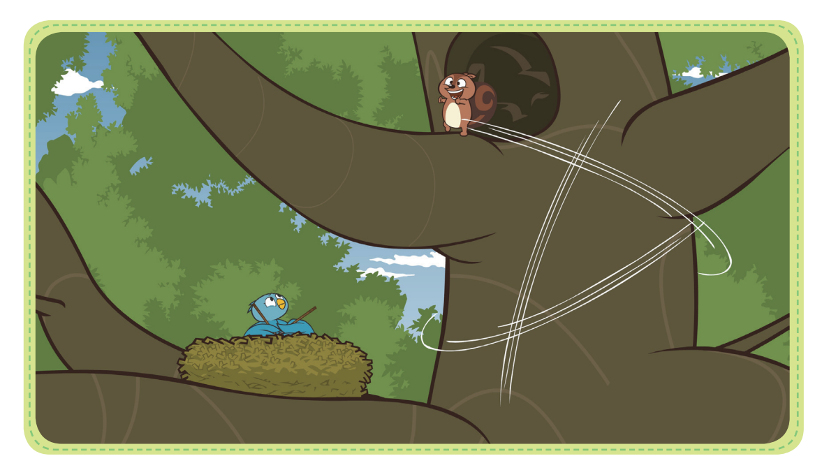
Kip zoomed up and down the tree trunk. "I'm a fast race car driver!" he said. "And I'm going to win the big race!"