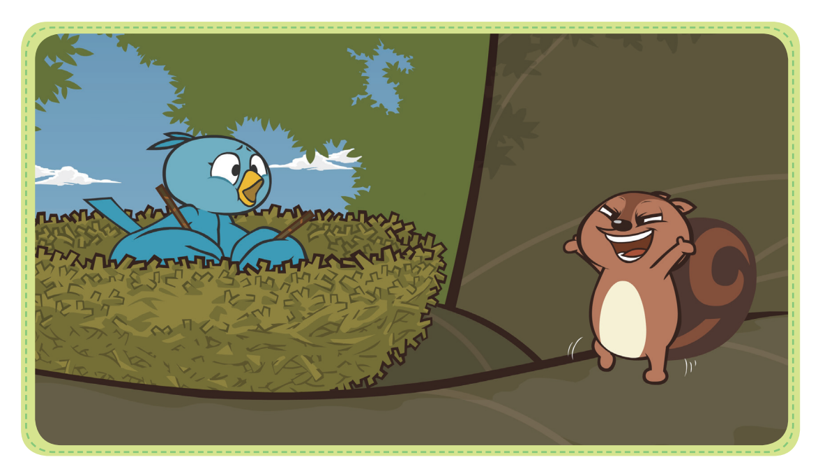
"And you're not being very careful," said Bird. "Nobody is faster than me!" said Kip.